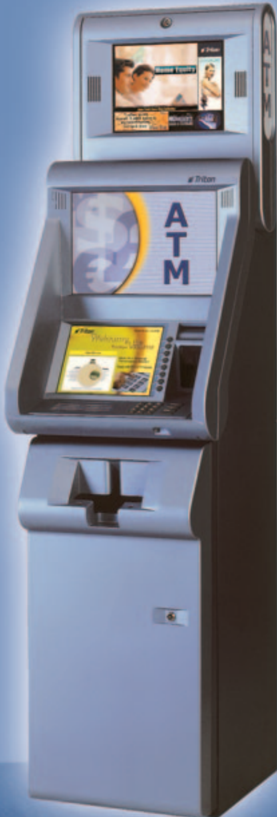
9800 with full-motion video topper

Triton's 9800 Series represents a revolutionary way of thinking in ATMs. With a sleek design and advanced revenue and compliance features, the 9800 is perfectly suited for both high-end retailers and financial institutions.